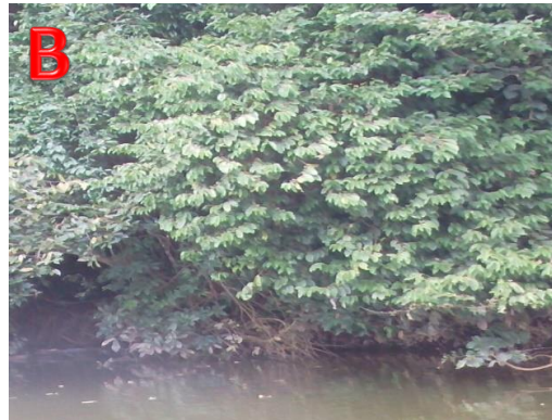
Figure 2: The edge of the lower part of the lake is not shaded with tree covers (A), whilst the upper part is shaded by tree covers (B).